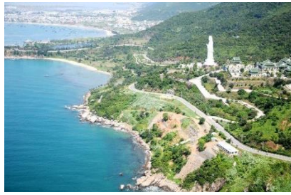
Son Tra Peninsula