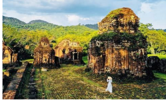
My Son Sanctuary