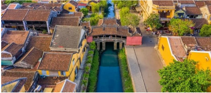
Japanese Covered Bridge

Hoian - Danang: 35 km => 35 minute transfer