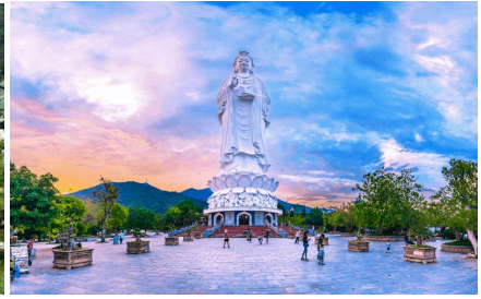
Linh Ung pagoda